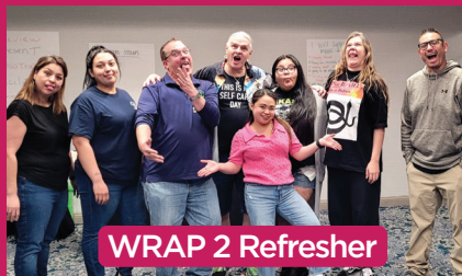
WRAP 2 Refresher

Contact Sam at samantha.tatro@cbhi.net for all WRAP related inquiries!