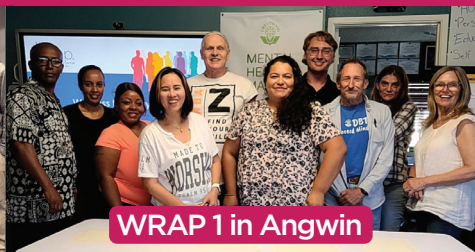
WRAP 1 in Angwin