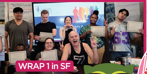
WRAP 1 in SF

"I EXPECT SOME NEW PHASES OF LIFE THIS SUMMER, AND SHALL TRY TO GET THE HONEY FROM EACH MOMENT." ~LUCY STONE